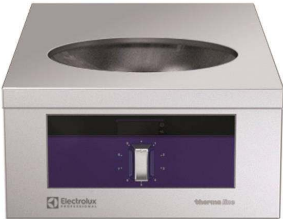
588025 (MAIHAAEOAO) Induction wok, 1 zone, one-side operated